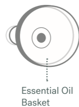
Essential Oil Basket